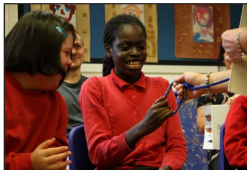
"Rick and Sally were walking their dog Patch, when suddenly, he ran off!" from Lost In London.

We can also run full-day training sessions, which include a copy of the pack, for £425.