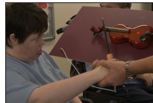
"Alice took out her violin and said, 'Listen to this!'" from Band Rehearsal.