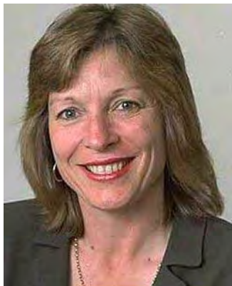
Jane Davidson, AM is Education Minister in the devolved Welsh Assembly.

BAG BOOKS HAD A SPECIAL VISITOR at the Wales Education 2004 Addysg Cymru show in May.